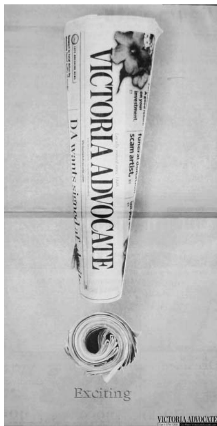
First Place Division 2 Dailies