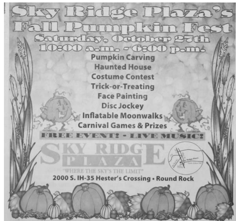
First Place Division 4 Semiweeklies